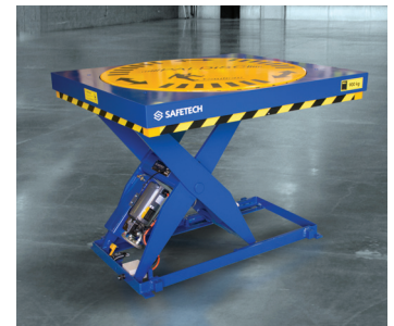
User-friendly lift controls

Applications include: Pharmaceutical, cold storage, Retail DC, warehousing, food.