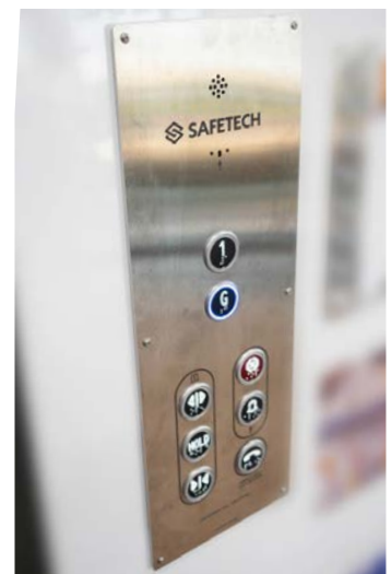
User-friendly lift controls

Our team are available with expert advice and assistance to get your facility to the next level. Contact us on 1800 674 566 or email sales@safetech.com.au