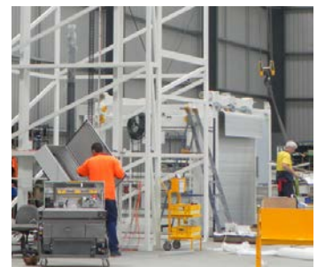
Made in Australia