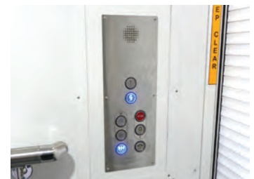
User-friendly lift controls