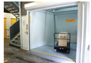
Designed for your lift requirements

Our team are available with expert advice and assistance to get your facility to the next level. Contact us on 1800 674 566 or email sales@safetech.com.au