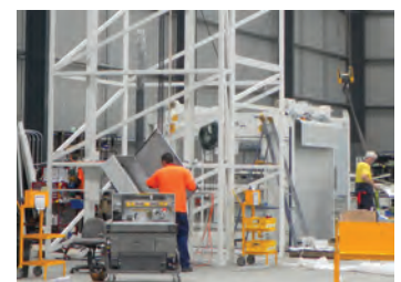
Made in Australia